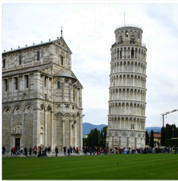
The Lovely Leaning Tower in Pisa, Italy