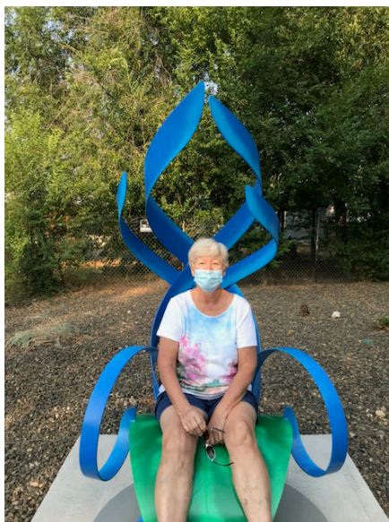
The Queen of the Greenbelt