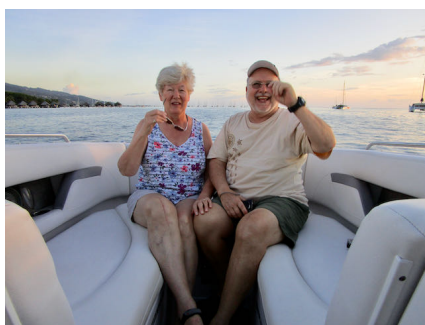
Traveling the Lagoon