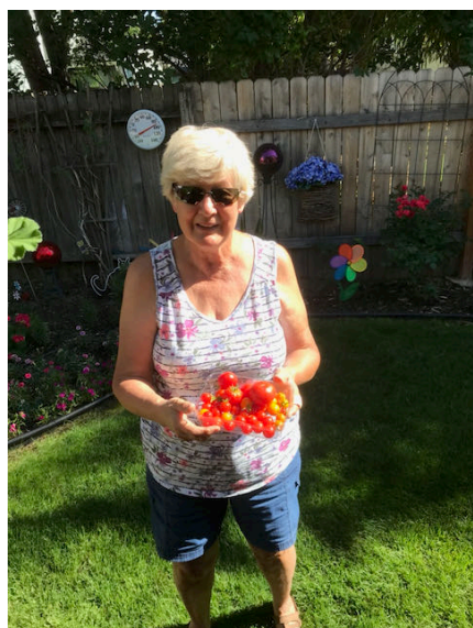
Bounty of the Garden