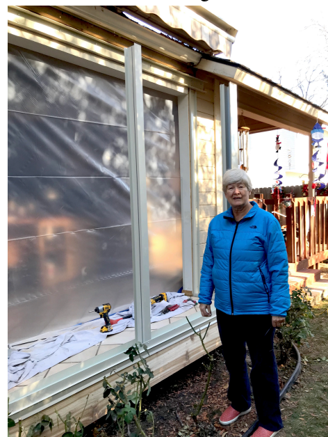
Replacing the Kitchen Windows

We Wish you a Happy and Healthy New Year. Merry Christmas!